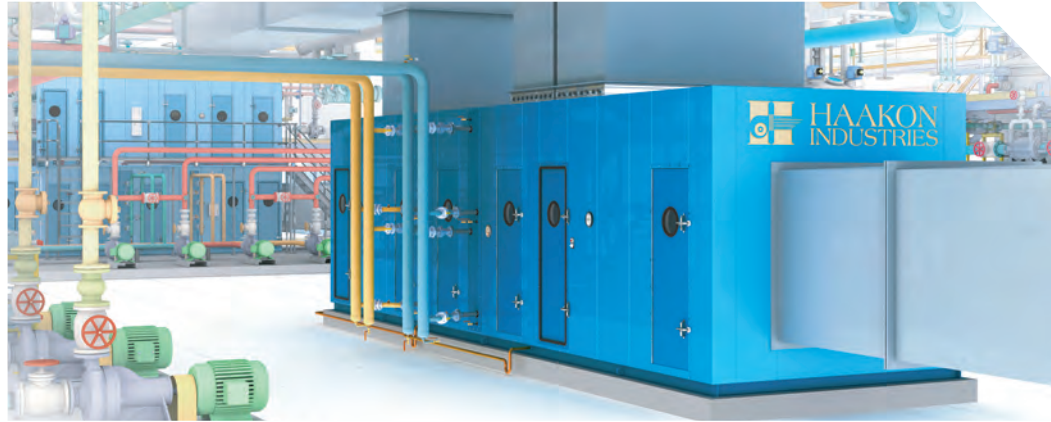
Mechanical room model developed by REVIT showing custom Haakon air handling and heat recovery units.

Haakon Industries is proud of their best-in-class status in delivering accurate